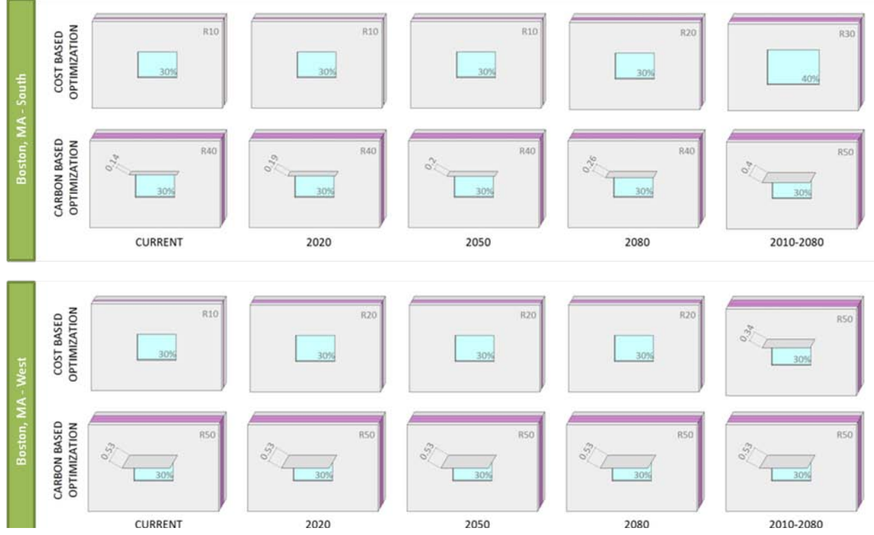
Figure 2 - Sample of optimized results from study, the south and west facades in Boston, MA.

In the long term '2010-2080' optimizations, savings aggregate to justify bigger expenditures in additional facade elements. For example, the window to wall ratio is usually larger than is suggested in the tenyear optimization scenarios, as the energy savings