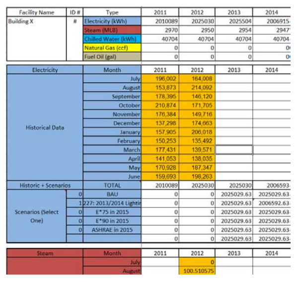
Figure 3- Details of an example building in the IBW

Using the IBW several scenarios may be created for each building detailing the various ways in which they may be renovated or otherwise changed over the course of the projection. This allows the projection to follow the same decision making process for planning the future development of the portfolio. By linking the projection tool to the method by which decisions are made, a powerful tool is created that will provide assistance in forming a plan to achieve specific goals, rather than simply setting a goal and hoping that the changes being made at the organizational level will lead to its realization.