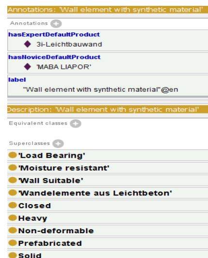
Figure 4 SEMERGY-Baubook mapping

In case of SEMERGY ontology, we have established the connection between Baubook classes and extended properties via adding subclass axioms between these two class hierarchies. In other words, after creating subclass relationships and running the