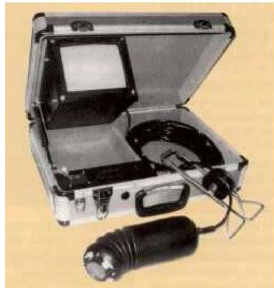
Figure 1 : Camera