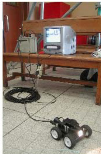
Figure 2 : Four wheel mobile camera unit (extract of BARBAT M. and FELDMANN C., 2006 – Cleaning Professional SIV VEISTA)

However additional studies have still to be carried out in order to define the limits and the accuracy of this method.