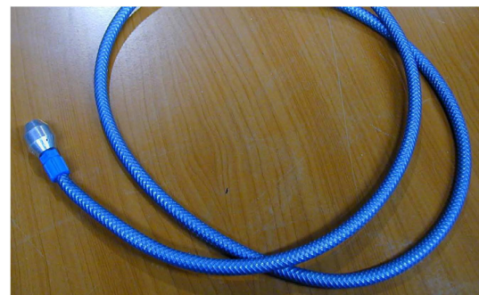
Figure 4 : Compressed air with a channel (extract of COSTIC and GHR, 2003)