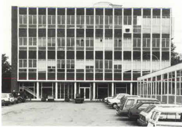
Figure 2 The conventional office building

Whole-building pressurisation tests were carried out in two medium-sized office buildings at the BRE site in Garston. The first is a conventional naturally ventilated office building (Figure 2) with an estimated volume of 6254 m 3 . Its outer face consists mainly of single-glazed, steel-framed windows and 13 mm thick insulated infill panels. Behind each panel there is a 114 mm air gap followed by a 114 mm thick brick wall lined with 16 mm of plaster on the inside. The external surface area (walls and roof) is estimated to be 2195 m 2 .