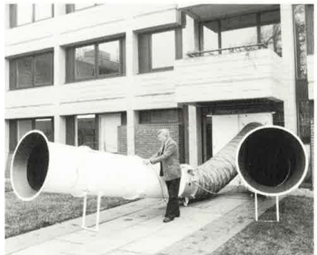
Figure 1 Two BREFAN fan pressurisation units installed in an external doorway of an office building

The BREFAN system was designed and built by BRE to address all these problems. Each of its three fan units is fully portable and can be powered from conventional 13 amp sockets. They can be used to pressurise most large (and naturally ventilated) non-domestic buildings (Figure 1).