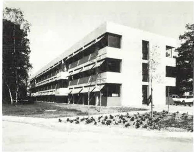
Figure 3 The low-energy office building

respectively. The LEO has a mechanical ventilation system which allows a varying amount of fresh air to be taken into the building, depending upon the setting of mechanical dampers at the air-handling unit. The occupants, though, are free to open the windows whenever they choose.