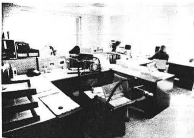
Figure 3b Cart in position at workstation

appropriateness of 26 affect ratings (adjectives). A clothing checklist screen (separate female and male versions were developed) presented an itemized list of clothing and asked for a rating on a four-point scale indicating the relative weight of each item. An activity checklist screen inquired about physical activity, eating, drinking (hot, cold, or caffeinated beverages), and smoking during the 15 minutes prior to taking the survey. A complete description of the subjective survey methods employed during the study, including a separate background information survey, is given by Schiller et al. (1988a).