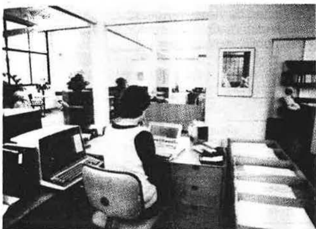
Figure 3a Thermal assessment survey administered on laptop computer

The thermal assessment survey used the ASHRAE Thermal Sensation and McIntyre scales as the primary measures of thermal sensation and comfort. Data were also collected on a secondary series of office work area questions (general comfort, draftiness, and brightness using six-point scales) and the