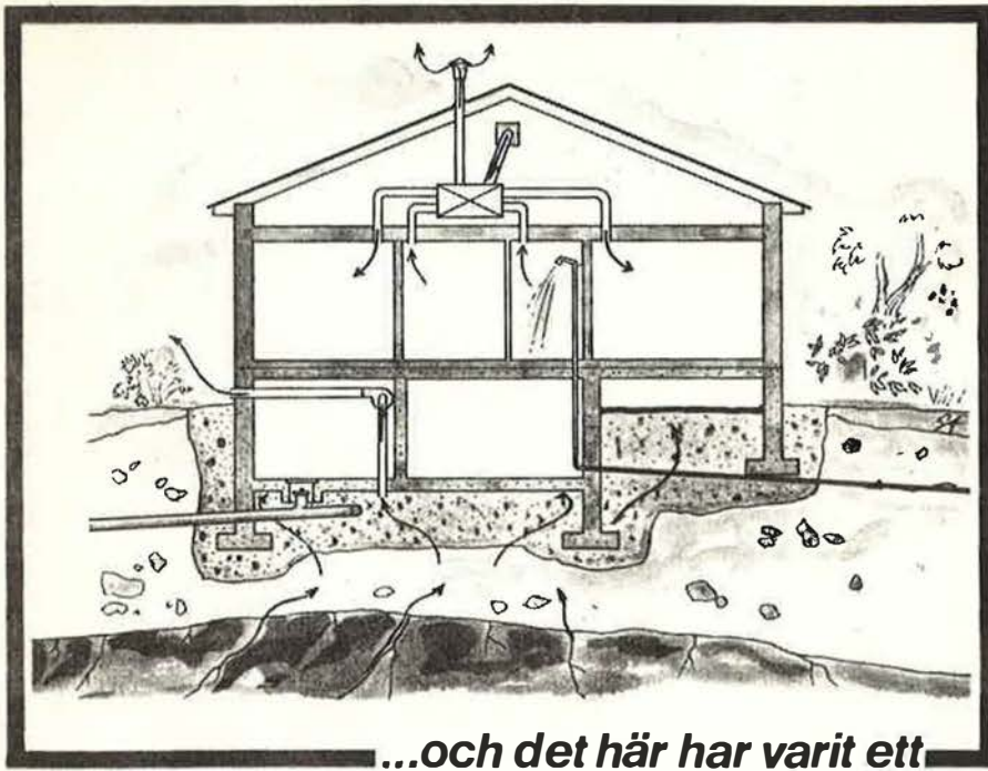
Figure 2. Illustration of normally succesful remedial actions in existing buildings with indoor radon from soil, building materials and water; sealing of untightnesses in the basement, depressurization of the capillarity breaking layer and installation of a balanced ventilation system. (Reproduced with permission from AIB Consulting Engineers, Solna, Sweden)