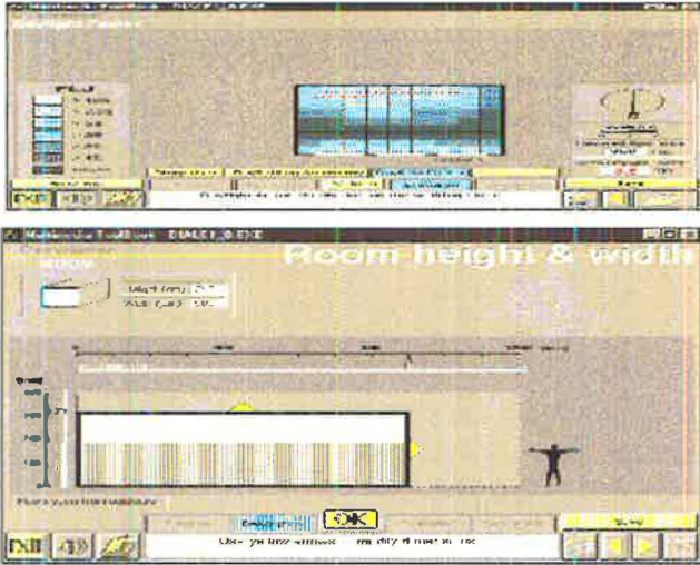
Screen views of the LESO DIAL daylight program showing the menu for room definitions and the calculated daylight factors in the room.