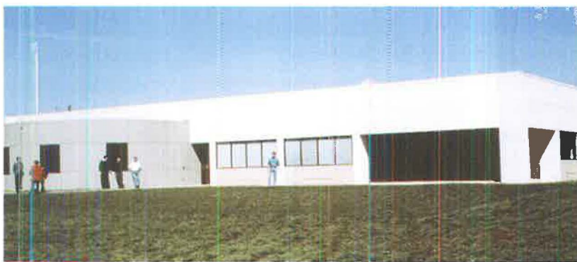
The Energy Resource Station test facility in Ankeny, Iowa is comprised of 4 sets of matched test rooms and a sophisticated HVAC system. This equipment was used to create laboratory quality test data for the empirical validation of building energy analysis tools