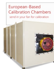
Calibration Upgrades portal.retrotec.com

Phone: +31 (0) 522 282941/ Email: salesEU@retrotec.com /Retrotec EU, Hardermaat 12, 7244PZ Barchem, Netherlands