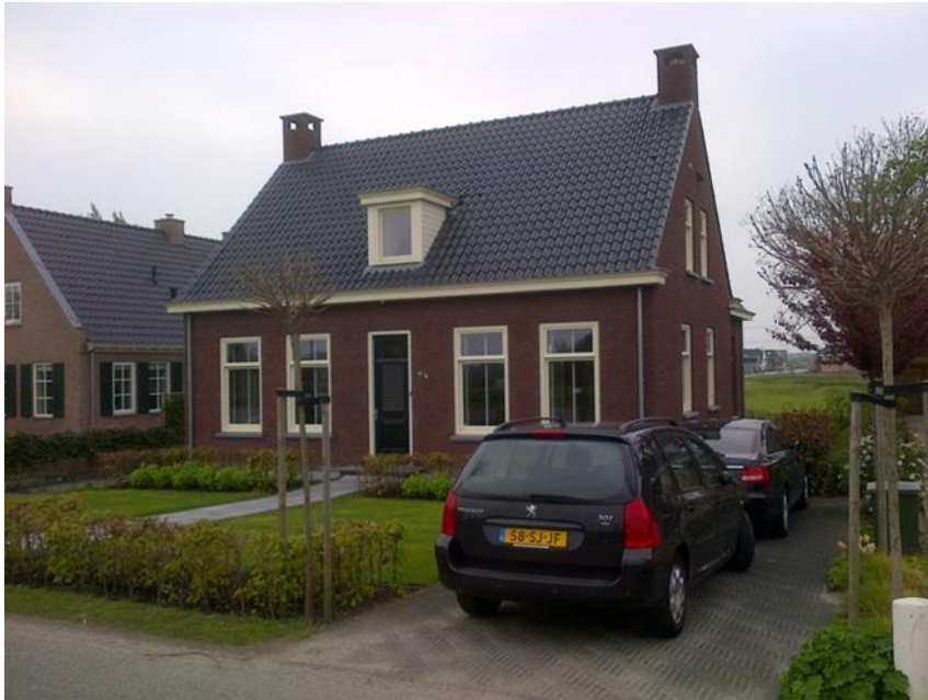
Figure 1: The monitored house in Rotterdam

A house (fig. 1) in Rotterdam, The Netherlands, is ventilated with a balanced ventilation system. The air distribution system is a flexible circular duct system with separate channels leading to the rooms in the house. The ventilation unit is controlled by a main CO 2 control in the living room. The air flow rate is set to a minimum of 210 m 3 /h and is increased automatically when the CO 2 level in the living room rises or as a result of a humidity sensor in the bath room.